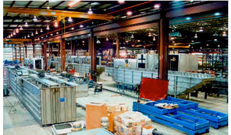
FABRICATION BAY PHOTO SHOWS SIMULTANEOUS CONSTRUCTION OF MONORAIL AND SLIDERAIL SQUARE TRANSFER (SST) ELECTROCOATING SYSTEMS